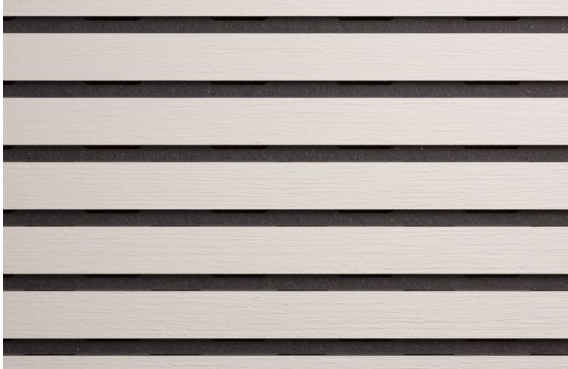
Absorption data for Groove 24-W (EN 354: 2003)